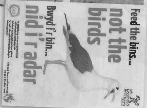
A poster on a bin in Swansea.

Outside pitches available on the day £44, set-up from 7.30am. Call us to pre-book an inside pitch www.towyevents.co.uk 01267 236569